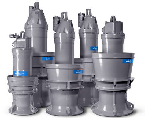
High-capacity Pumps | Standard