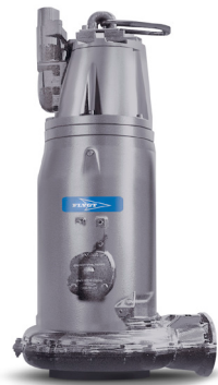
High-capacity Pumps | Standard