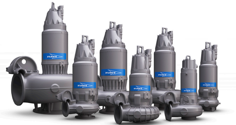
High-capacity Pumps | Standard