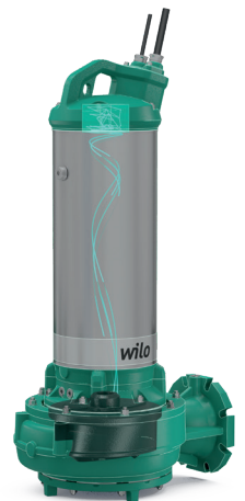
Wilo-Rexa SOLID Q with Nexos intelligence